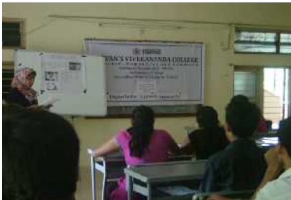
Class Room activity on Digital India a growth Perspective