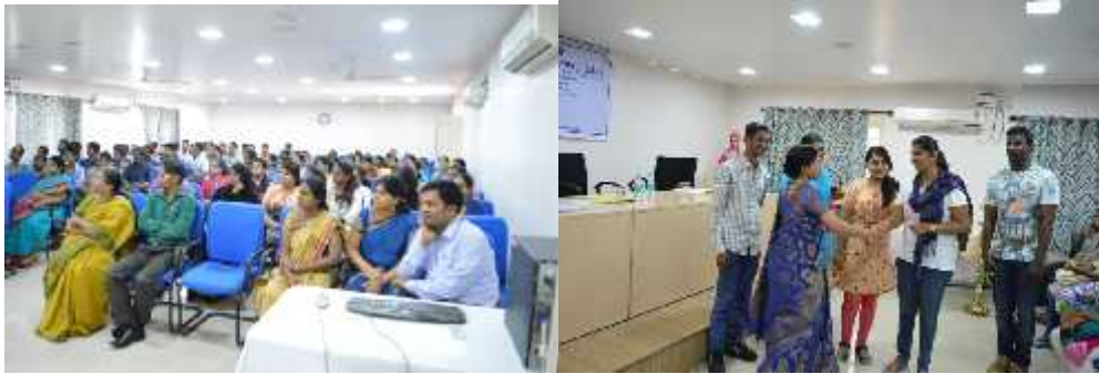
MBA Orientation Day Programme